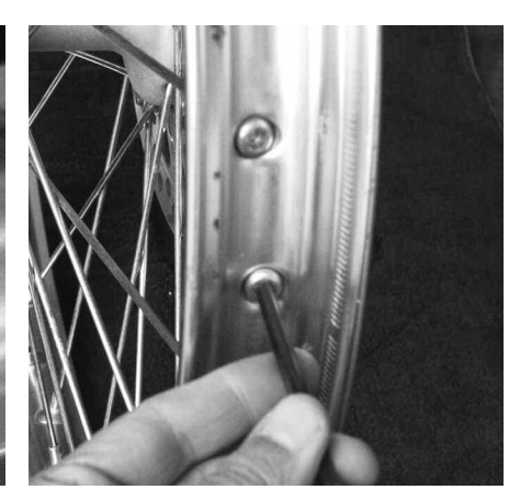
Left: A perfect fit between spoke wrench and nipple makes the job easy and...(Center) prevents this from happening. Not only is this nipple rounded, it's also become crushed against the spoke threads, making it doubly difficult to remove. Right: Once loosened "topside" with a wrench, nipples can be unscrewed easily from the other side.

sets may require special measures, such as setting the rim on a couple two-by-fours in order to get its centerline at the midpoint between the two hub flanges. You'll be lacing one hub flange completely before turning everything over. Thread the first spoke through its hole in the hub, and then insert its threaded end into the rim, taking care to chose a hole angled upward (toward the side of the hub you're currently working on). If you're working on a very fancy wheel, the rim for which has holes cut at more than two angles (left and right), you'll need to make sure that the spoke's entry angle matches the rim hole's angle precisely. (You can check this by simply inserting a pencil through the hole and confirming that the spoke lines up with it.) Now, after putting a drop of lubricant on the threads to inhibit corrosion, screw a nipple onto the spoke tip—but only a couple turns. This keeps the spoke from falling back out of the rim, but leaves you maximum room to push the rim away from the hub in other directions to give subsequent spokes the clearance they need for easy insertion.